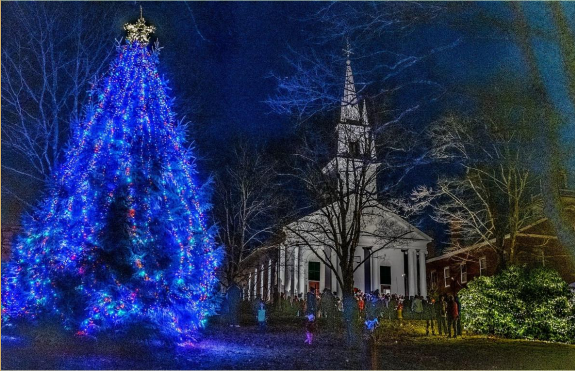
The Tree Lighting!